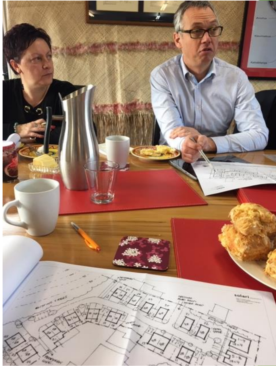
Planning of medium-density housing around marae